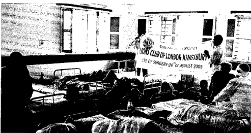
Patients on the recovery ward following eye surgery.